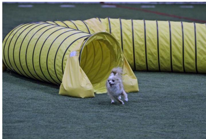
"Isn't This Fun?"

Casey earned his Agility Excellent Standard title and Excellent Jumpers title the same weekend in Dec 2007. In 2007 he also earned the UKC Grand Agility Championship title and was invited to compete at the UKC Premiere as an agility All Star in all three levels. Agility is his passion and I believe that he could do it everyday.