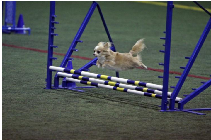
"I Can Soar So High"

In Jan of this year Casey finished his Agility Excellent title and now we are working to complete his Master Agility and Master Agility Jumper titles. He also earned a third invitation to the UKC Premiere as an AGII and AGIII All Star.