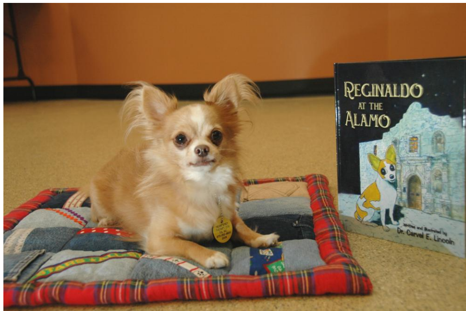
"Casey & his book"

Besides agility, Casey loves being a Therapy Dog. Although he can be a little reserved around strangers, he loves participating in the Tail Wagging Tutors program where kids get to read to him. Our libraries call it Paws for Reading.